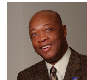
The Office of Minority Programs (OMP) is established within the National Institutes of Health (NIH) Office of the Director. The OMP convenes town hall meetings nationwide to gather input for the Minority Health Initiative, a multi-year research and training program.