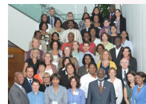
Through the Patient Protection and Affordable Care Act (P.L. 111-148), NCMHD becomes the National Institute on Minority Health and Health Disparities (NIMHD) , highlighting the law's emphasis on health disparities and minority health. NIMHD launches a 2-week intensive Translational Health Disparities Course , "Integrating Principles of Science, Practice, and Policy in Health Disparities Research."

NCMHD holds the first NIH Science of Eliminating Health Disparities Summit and announces the Intramural Research Program to create training and mentorship opportunities for early stage and seasoned investigators to enhance NIH's diversity of scientists and research disciplines.