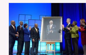
NIMHD hosts the second Science of Eliminating Health Disparities Summit in partnership with the NIH Institutes and Centers, HHS agencies, and 14 of 15 federal executive departments, highlighting strategies, policies, and models from around the world to combat social, economic, and environmental factors that cause health disparities.